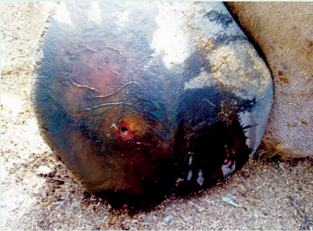
Punctured foot condition