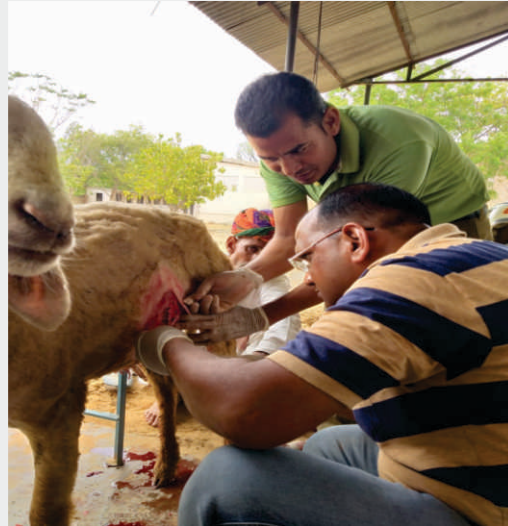
Examination and beginning of the surgery