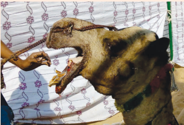
Broken and hanging lower jaw