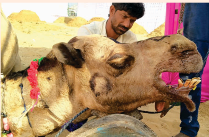
Camel after fixation of the jaw