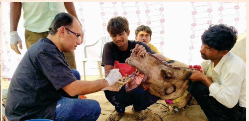
Process of fixing the mandible