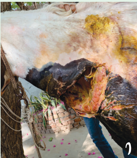
At the time of rescue