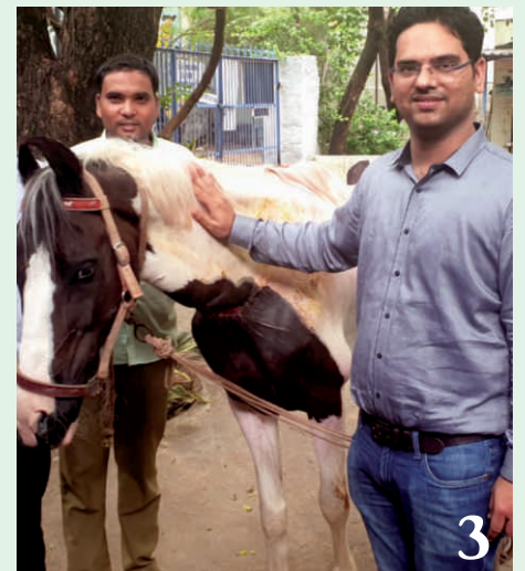
After the healing