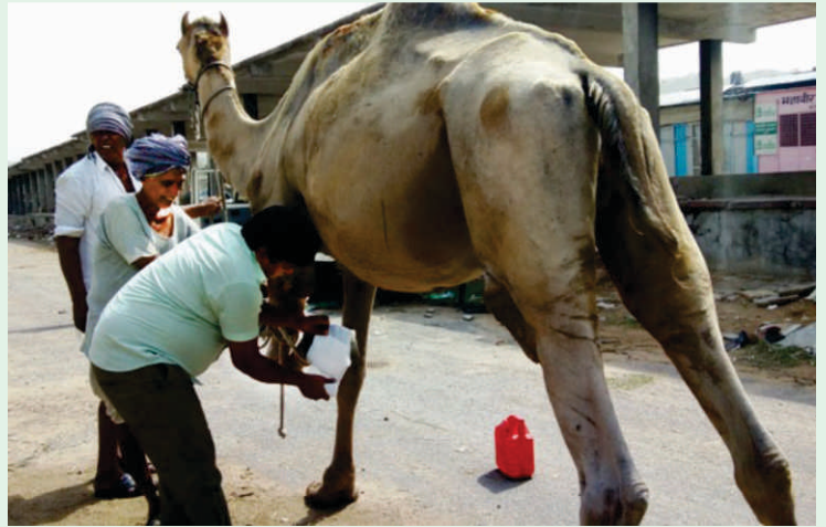
Camel's leg is bandaged after antiseptic dressing

Saddle wounds - Negligence is the main cause of this painful condition. Improper saddle is used for long time and results in saddle sores. Antiseptic dressing, antibiotics, painkillers and proper rest are the treatment.